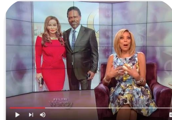
Gospel Goes To Hollywood - Arrivals